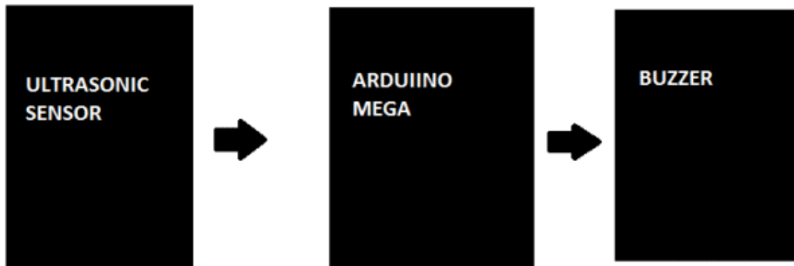
Fig. 2. Working Model

To make the prototype, you will have to follow the below steps: