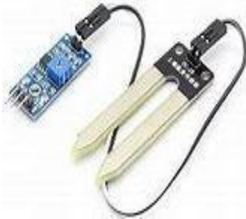
Figure 4: Soil Moisture Sensor

Soil moisture sensor measures the water content in soil. It uses the assets of the electric resistance of the soil. The relationship the various measured belongings and soil moisture is calibrated, and it varies depending on environmental factors consisting of temperature, soil type, or electric conductivity. Here, it is used to experience the moisture in discipline and transfer it to raspberry pi a good way to take controlling movement of switching water pump ON/OFF.