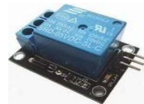
Figure 5: Relay