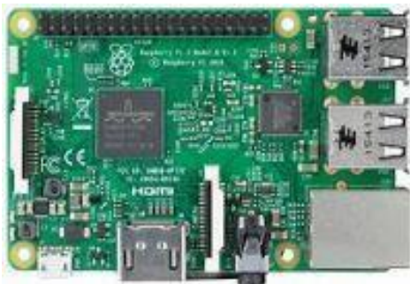
Fig. 2 Raspberry Pi

With remote location controlling device becomes possible. Raspberry Pi is to be had in numerous versions. Here, version Pi 2 version B is used, and it has quad-middle ARM Cortex-A53 CPU of 900 MHz, and RAM of 1GB. It additionally has: forty GPIO pins, Full HDMI port, four USB ports, Ethernet port, 3.5mm audio jack, video Camera interface (CSI), the Display interface (DSI), and Micro SD card slot.