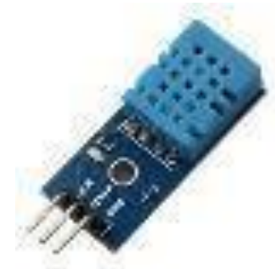
Fig. 3 DHT eleven Sensor