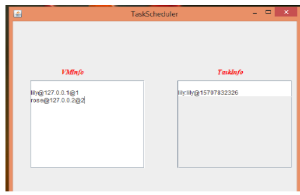
Fig. 3 Task scheduler framework

To limit the delay obliges the framework configuration is brings the round mean square estimation of information use and framework security in sending the assets on ask. The assets are cloud-lets and are gone up against the request issues. In this way the general framework behavioral model is annexed and observed for the framework behavioral and execution change. The admin of the framework monitors and takes think about this supporting operation. The schedulers are utilized and broke down for a framework administration and consequently the general demand (approaching solicitations) are prepared and sustain to the administrator experts for basic leadership. The framework apportions the outer assets under the IP behavioral approach. In light of the demand the assignment is booked for autonomous server and therefore the accomplished framework is more dependable and secure under the information evaluation and asset sharing condition.