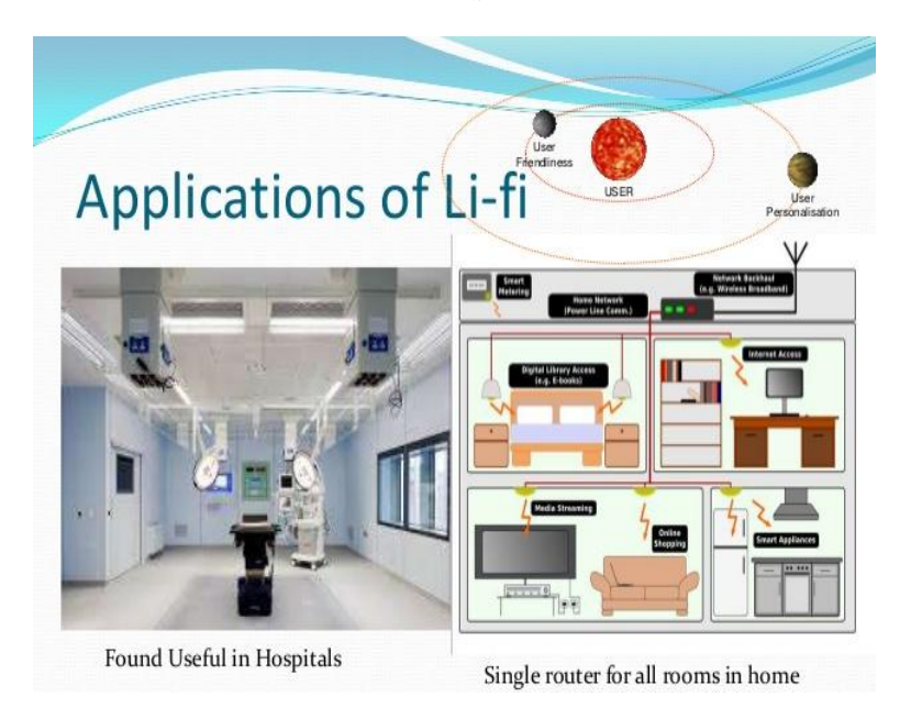
Fig. 2 Applications