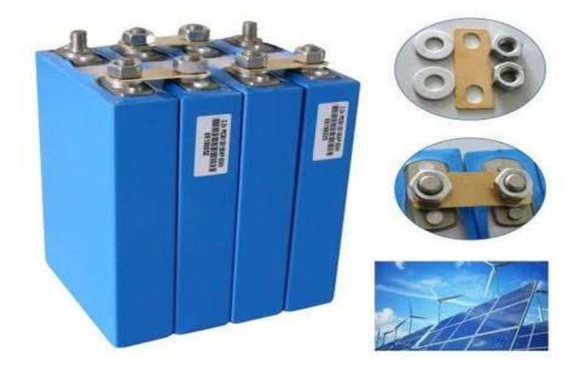
Fig. 1 80Ah 24V Battery

an external communication system. A smart battery pack must be charged by a smart battery charger, but before charging battery balancing circuit has to use for setting up the battery storage system for better performance.